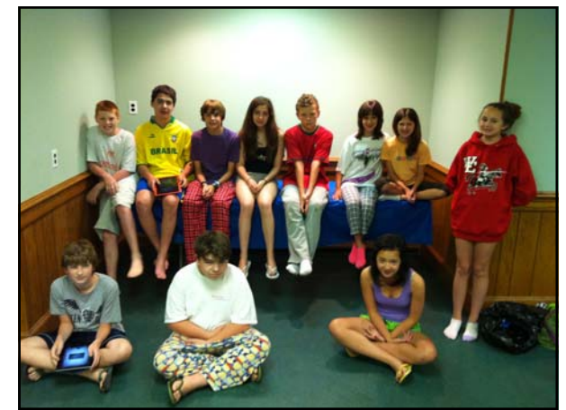
Jr. SPY Overnight June 2011

Saint Peter's will be offering an opportunity for adults to prepare to make mature affirmation of their faith in our Episcopal tradition later in the year. Please watch for details.